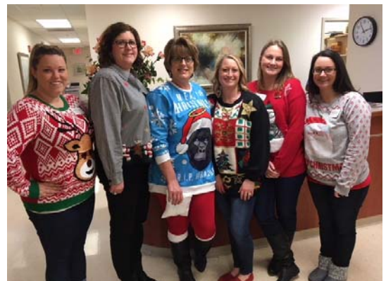
New Life Bariatric staff completed for "ugliest sweater" honors. Can you tell who won?