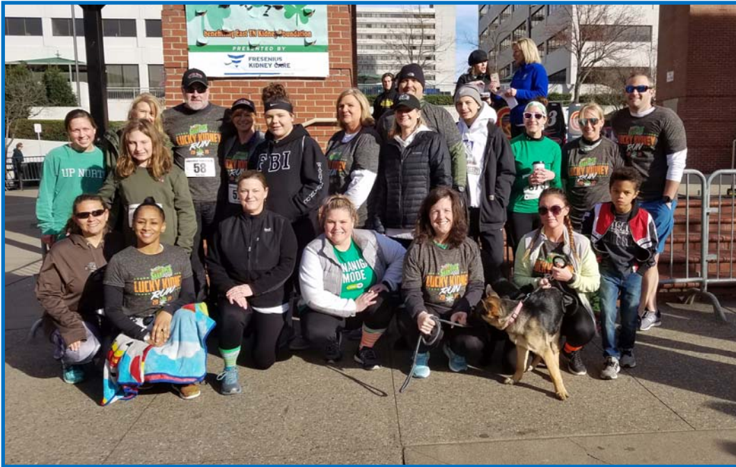
Premier Surgical was proud to be a sponsor of the 2019 Lucky Kidney Run to support the East Tennessee Kidney Foundation!